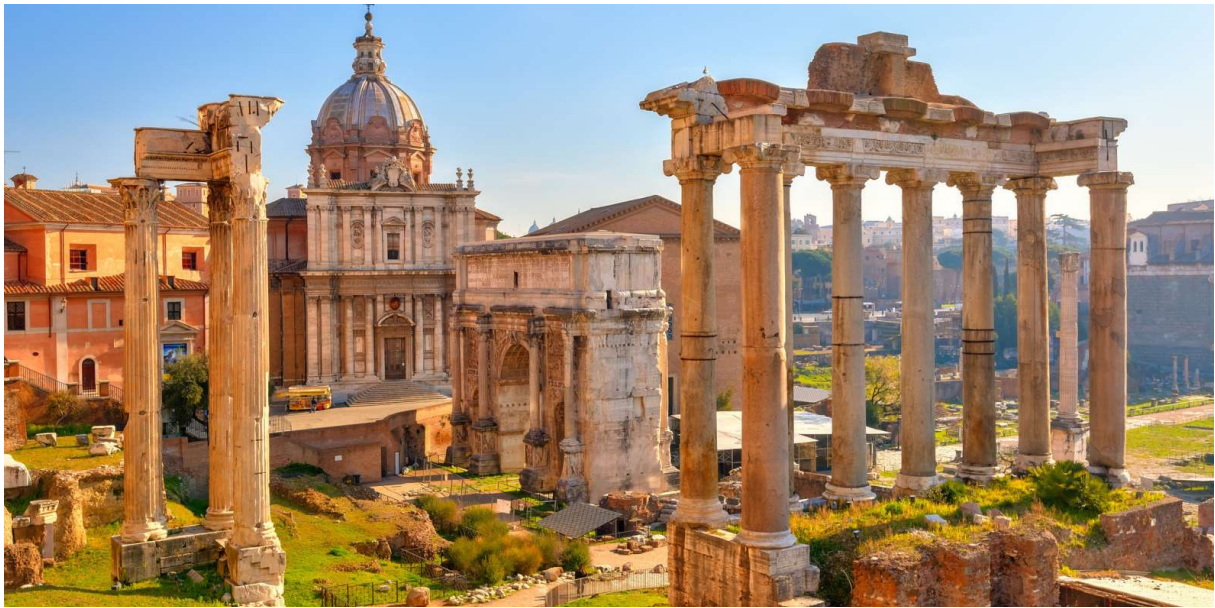
The Forum Romanum (Town centre of ancient Rome)