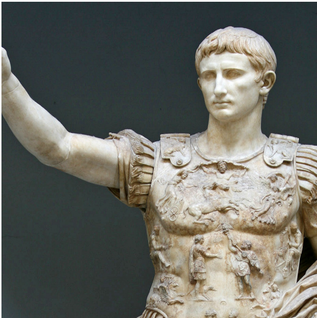
Augustus Caesar: The Prima Porta Statue