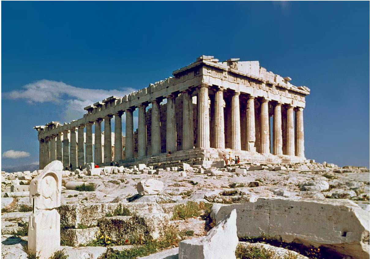
The Parthenon, Athens, built in the 5 th Century BC