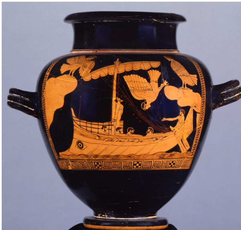
Red figure vase: Odysseus and the Sirens

Make sure that you complete at least part 1 of the mini course. Complete the whole thing if you like!